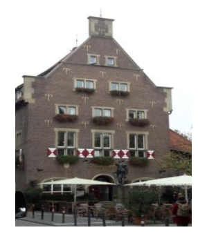
The inn "Großer Kiepenkerl"

> 12.30- 13.30 p.m.: Lunch at a traditional inn in Münster, the "Kiepenkerl"